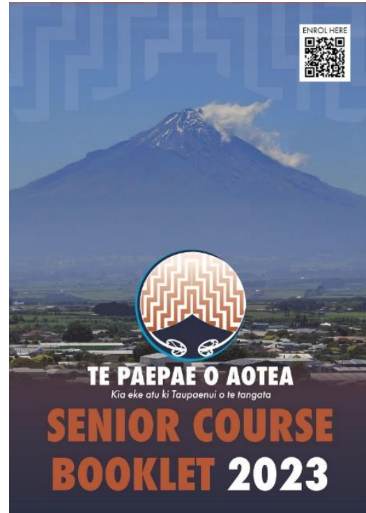
Senior Course Booklet